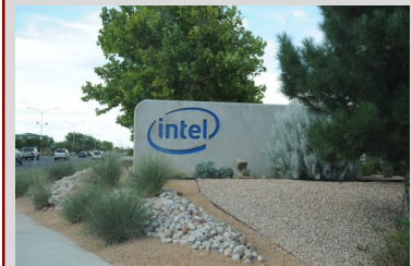
Intel Site in Rio Rancho, NM